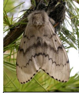
Gypsy Moth.

Oregon’s battle with invasive species is serious because of the potential environmental, economic and social consequences of these invaders. Agencies and organizations responsible for keeping invasive species out of Oregon and managing those that enter the state have many tools that can be used—alone, and in combination with one another—to fight invasive species. These tools range from use of biological controls to chemicals, to mechanically removing species by hand. But each time the toolbox is opened to explore potential ways to eradicate an invader, the human dimensions aspect of managing invasive species—the public response to the tool—has to be considered.