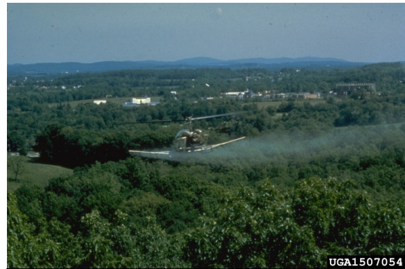
A helicopter sprays at low altitude.